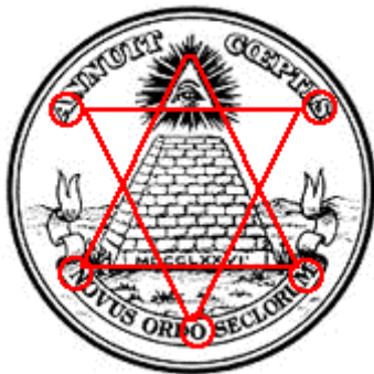
Illustration showing the reverse of the Great Seal of the United States found on the $1 bill - with lines linked to read M-A-S-O-N, although it can just as easily be read as one of 120 possible letter combinations.